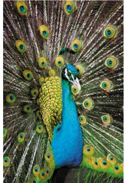
This photo of a peacock showing off for his lady demonstrates that you don't give up rich color when you use new Max Zoom 800 film.