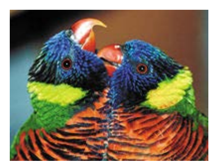
Colors look great in flash pictures, too.

file:///L|/Magazines/web_articles/Photographic%20articles/Max%20Zoom%20800%20page%201.htm[4/16/2011 4:22:02 PM]