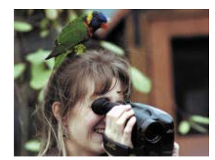
Max Zoom 800 is great for general snapshooting.