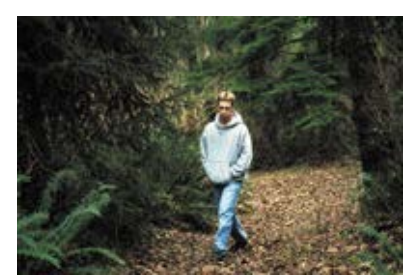
Nature photography by natural light is a great test for any color film. And Max Zoom 800 passed with flying colors.