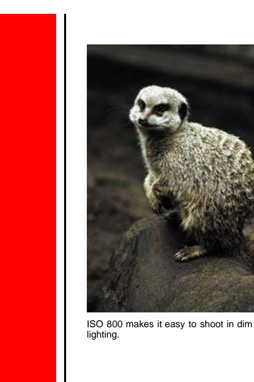
don't realize is that these zoom camera's lenses decrease aperture size as the lens is zoomed to its longest focal length—the maximum aperture at the maximum focal length might be in the f/9-f/11 range. This translates to more underexposure, more blur in moving subjects, and an overall decrease in depth of field. The solution is to compensate for this loss of light with a higher speed film. To better understand how an ISO 800 film can improve your images, let's look at some typical situations you might encounter.