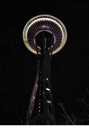
Night photography requires fast film or a steady tripod. Max Zoom 800 lets you leave the tripod behind, yet you don't give much in terms of image quality for the privilege.